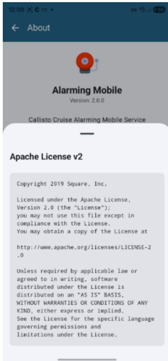
Figure 14: License details bottom sheet